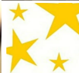
Scenes from An Enchanted Evening A good time was had by all!