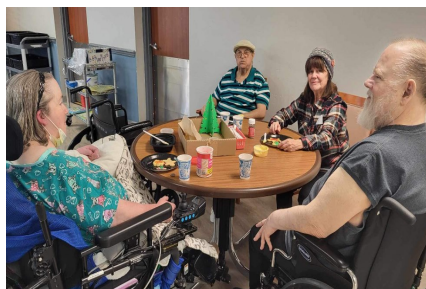
Omro Care enjoyed Bingo and Decorating Christmas Cookies!