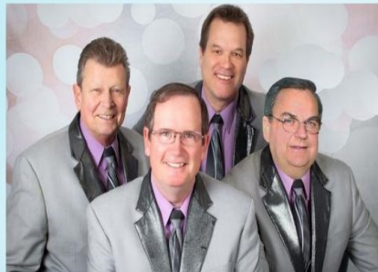
Music from the 50s, 60s and 70s