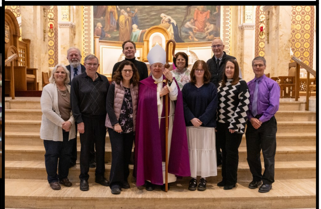
Rite of Election and Call to Continuing Conversion St . Francis Xavier in Green Bay