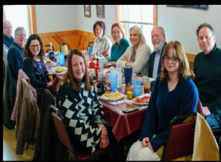
Breakfast at Jackie's in Winneconne